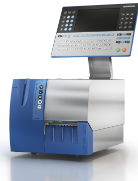
GLPmaxx 80, stainless steel version

The GLPmaxx can be used as a label printer for product labeling in the food processing industry as well as in manufacturing trade and logistics. It is perfectly suitable for dispatch and stock labels. In combination with the Bizerba weighing technology it is the perfect starter kit for manual price labeling. The printers are network compatible and can also be controlled directly via the Internet. Settings and maintenance of the printer unit can be made without need of any tools - reducing costs and increasing print quality. The new PC-based hardware provides more memory space and fast label data processing. By means of an USB port it is easy to run data backups and to buffer statistical data. The operating terminal GT-7C with color display can be operated ergonomically and thus reduces operating errors. The GLPmaxx Linerless processes Linerless labels without carrier material. As the roll contains 40% more labels, the set-up time is reduced for the same number of packages.