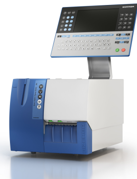
GLPmaxx 80, painted steel version